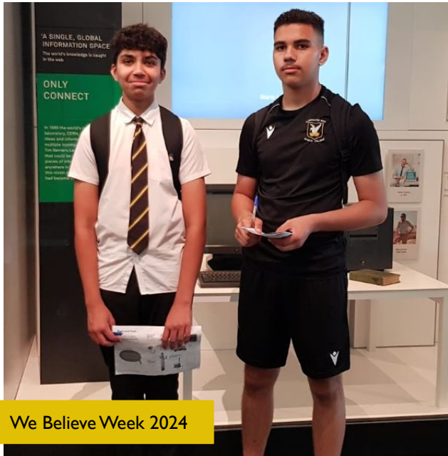
We Believe Week 2024