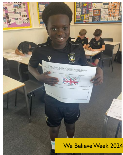
We Believe Week 2024