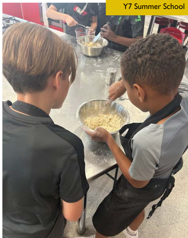
Y7 Summer School