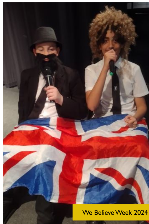
We Believe Week 2024