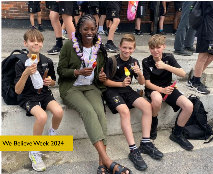
We Believe Week 2024